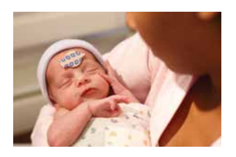
Jaundice Management Proven jaundice management solutions based on our developmentally friendly approach to treating newborns