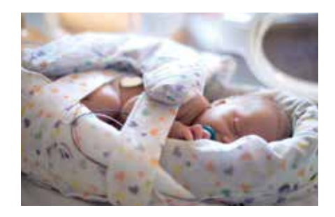
Positioning Aids Developmentally appropriate positioning solutions that help support caregivers' efforts in caring for the most fragile infants